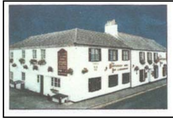
The Sportsman Inn