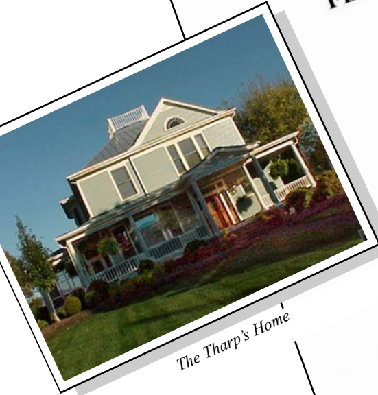
The Tharp's Home